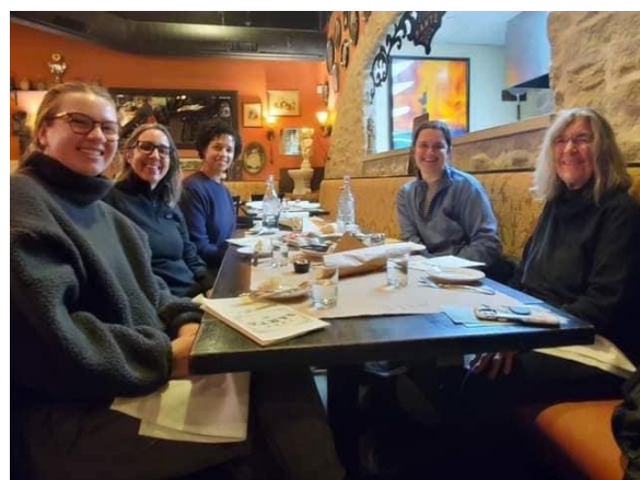
Raven Hill hosted the Smithsonian team for a pre-workshop dinner. Thanks, Café Sante, for a warm welcome to the area, after a rather harrowing drive from Traverse City in whiteout conditions!

In conjunction with the Spark! exhibit, the Center was also selected to participate in a Smithsonian project called Youth Innovation in Rural America (YIRA) . Raven Hill is working with MoMS and the Cooper Hewitt Smithsonian Design Museum on this project and is one of only two sites chosen out of four states (Idaho, Illinois, Kentucky and Michigan) to partner with the Smithsonian on this project.