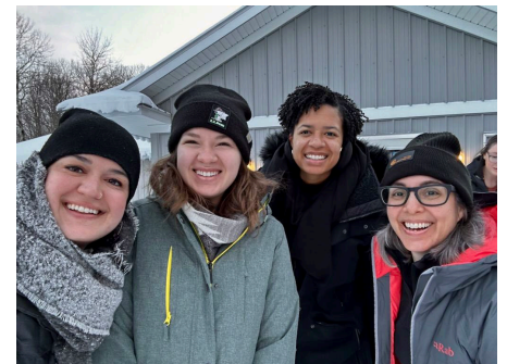
From beginning to end, thank you Smithsonian—for sharing your talents and providing an awesome professional development experience for northern Michigan teachers. We can’t wait to get started on innovation design projects with our own students!