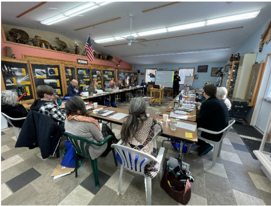
Excitement filled the Great Room at Raven Hill as area teachers gathered for a unique opportunity to work on innovation design with New York City’s Cooper Hewitt Smithsonian Design Museum educational team.