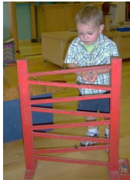
This marble roll is at least 70 years old and still entertains visitors in the hands-on Discovery Room at the Center.

Sometimes old stuff ends up in the hands-on Discovery Room, where visitors delight in “calling” each other on the old phones or playing with the marble rolls. A donor might decide to get rid of an old toy or musical instrument they no longer use, considering it clutter. Many of our older visitors find themselves nostalgic for that item and/or era, while the younger set just enjoy the hands-on nature of the old stuff . An old stoplight with each of the three colors wired to switch separately is great fun for the little ones and often becomes a form of “freeze tag” to the older kids.