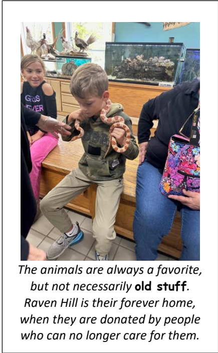
The animals are always a favorite, but not necessarily old stuff . Raven Hill is their forever home, when they are donated by people who can no longer care for them.

So, it seems particularly fitting for us to recognize National Old Stuff Day on this 2 nd day of March, because we make room for a lot of old stuff here. Sometimes it fits perfectly in one of our timelines, like old telephones or typewriters. Other times, visitors may notice that many of our exhibits are found displayed on old furniture or in old display cases. As the saying goes, “One man’s trash is another man’s treasure.”