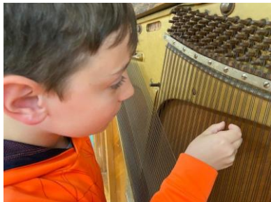
Finding someone to take certain old stuff can be a real challenge, especially things like old pianos. One donated piano has become a popular hands-on exhibit in the Center’s Discovery Room. The Piano Harp can be hit, strummed or plucked to create sound vibrations.

Sometimes old stuff ends up in the hands-on Discovery Room, where visitors delight in “calling” each other on the old phones or playing with the marble rolls. A donor might decide to get rid of an old toy or musical instrument they no longer use, considering it clutter. Many of our older visitors find themselves nostalgic for that item and/or era, while the younger set just enjoy the hands-on nature of the old stuff . An old stoplight with each of the three colors wired to switch separately is great fun for the little ones and often becomes a form of “freeze tag” to the older kids.