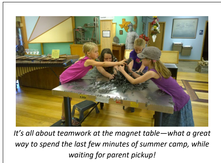
It's all about teamwork at the magnet table—what a great way to spend the last few minutes of summer camp, while waiting for parent pickup!

Early on, we realized that the magnet table was a great team builder for families and groups of children. Working together, visitors can use the washers to build a tower up to a line on the sign hanging above the table. The line says “tower height”. Once that height is reached, the tower is timed for 30 seconds. Everyone who helps build a successful tower gets a small prize. We also quickly learned that we had to limit the number of tower prizes to three, so that visitors would not spend all of their time at the magnet table, but take time to enjoy other exhibits at the Center as well!