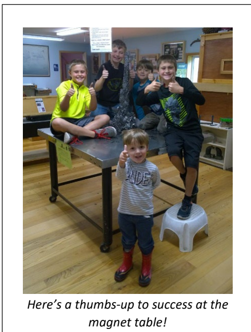
Here's a thumbs-up to success at the magnet table!

Early on, we realized that the magnet table was a great team builder for families and groups of children. Working together, visitors can use the washers to build a tower up to a line on the sign hanging above the table. The line says “tower height”. Once that height is reached, the tower is timed for 30 seconds. Everyone who helps build a successful tower gets a small prize. We also quickly learned that we had to limit the number of tower prizes to three, so that visitors would not spend all of their time at the magnet table, but take time to enjoy other exhibits at the Center as well!