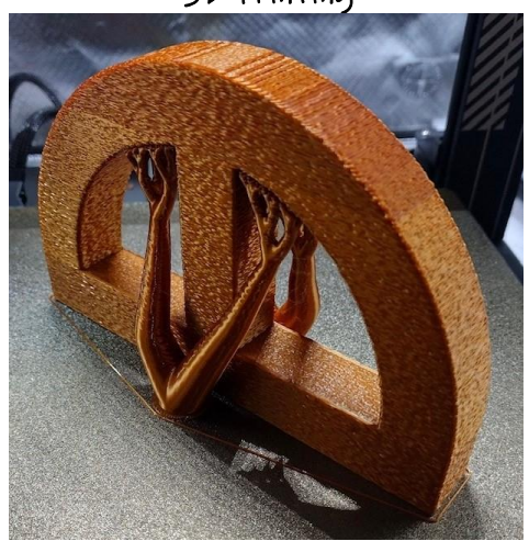
Section #1 out of 12 is 3D-printed for the 12" x 30" Medieval door, one of 16 doors in the History of Doors timeline at the ET Building! Even the hinges and latch are 3D-printed! The little "trees" shown here print out as supports for the arch to keep it from sagging during the printing process!