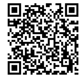
Support informal learning at Raven Hill!