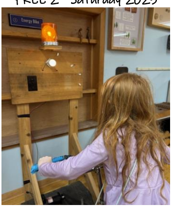
The generator bike is a hit with the kids! It's a fun way to spark curiosity about science & energy.