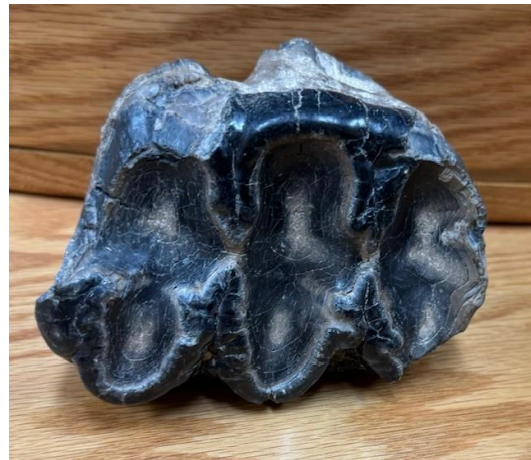
Fossilized mastodon tooth. --Raven Hill Collection

At Raven Hill Discovery Center, you can have the incredible opportunity to get up close and personal with fossilized mammoth and mastodon teeth! Visitors can even touch these ancient relics under supervision—just ask! Plus, don't miss the chance to explore our "Exploring Beyond Jurassic Park" exhibit, where lifelike replicas of these fascinating teeth bring the Ice Age to life!