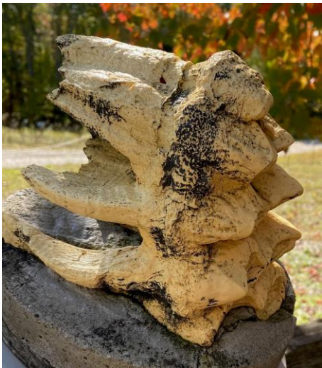
Replica mastodon tooth.

On the other hand, mastodons evolved in North America. They belong to a different family which diverged from the ancestors of elephants and mammoths much earlier, around 20 to 25 million years ago. Mastodons have stockier bodies, shorter legs and straighter tusks compared to the mammoths. They preferred more of a forest environment, feeding on trees, shrubs, and woody plants. Mastodons are browsers, so they have teeth that are smaller and sturdier with a few high cone-shaped cusps, ideal for crushing tough vegetation in forest areas. The vast tracts of forest in Michigan may account for the fact that there are more mastodon fossils found in Michigan than mammoth remains.