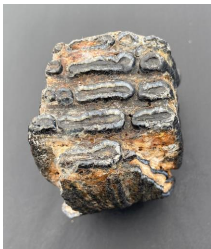
A portion of a fossilized mammoth tooth. --Permanent loan from Roy Wynkoop

Mammoths are more closely related to modern elephants than mastodons. Mammoths and modern elephants evolved originally in Africa. They have similar body structures, including a long curved trunk and large tusks. They also share similar teeth, reflecting the fact that they come from similar environments. Here in Michigan, mammoths were suited to the colder grassy plains of Ice Age Michigan, where they primarily grazed on grasses and other low lying vegetation. To break down fibrous plants, elephant and mammoth teeth are long, narrow and flat with parallel ridges made of enamel plates, for grinding.