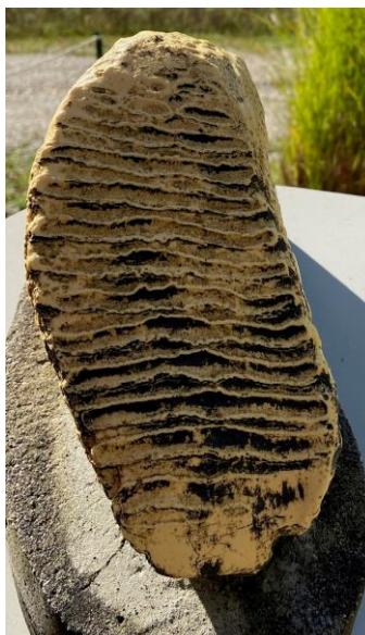
Replica mammoth molar --Raven Hill Collection