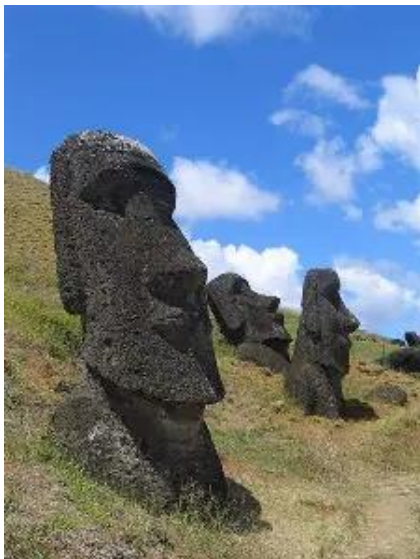
Moai in situ on Easter Island