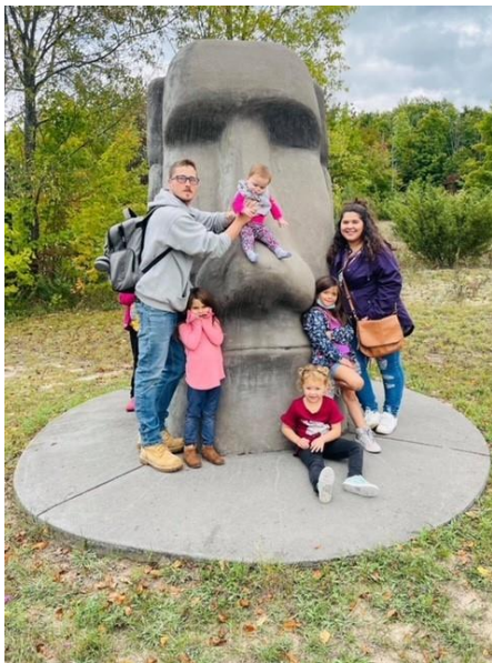
DumDum poses for photo-op with family!

Our DumDum captures the iconic look of the actual Moai, but there are significant differences. First, most of the original Moai sculptures are much larger than Raven Hill's 10-foot version. The actual sculptures average about 13 feet tall with some reaching 30 feet tall. Second, the authentic statues were painstakingly carved from a soft rock called volcanic sandstone or "tuff" (pronounced "tough") and then polished. Our DumDum is Styrofoam covered with chicken wire and five coats of cement.