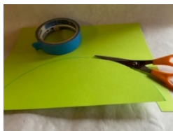
2 Cut half circle