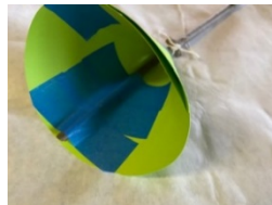
4 Tape stick inside cone