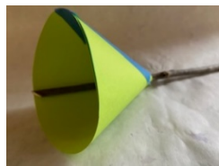
3 Form cone, add stick