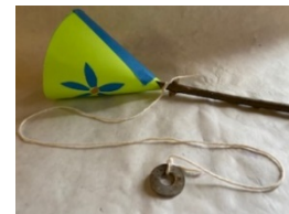
5 Add string & button