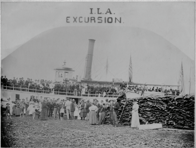
LABOR DAY EXCURSION. BOYNE CITY TO EAST JORDAN, SEPTEMBER 5TH, 1898.