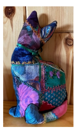
Dressing up & sewing are two things Mom loved to do for Raven Hill!