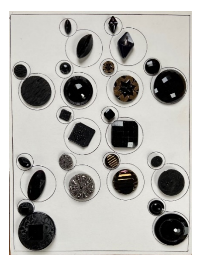
Mother-daughter pairs are always special. That goes for buttons too!

Mom belonged to the Jacksonian Button Club and enjoyed designing cards for competitions. This card of "Mother/Daughter" black glass buttons is one of my favorites and is certainly appropriate for this weekend. Whether you are a great-grandmother, grandmother, mother, daughter, granddaughter or a supporter of women, enjoy this weekend and think fond thoughts of the mothers and mother figures in your world! "A mother is your first friend, your best friend, your forever friend."—Unknown. Mom was certainly a first friend, best friend and forever friend to Raven Hill. Thank you, Mother, for your faith in the Center and for all you have done to make Raven Hill what it is today! Come enjoy our new pearl button display in Mom's honor—the button tradition has certainly passed from grandmother to mother to daughter!