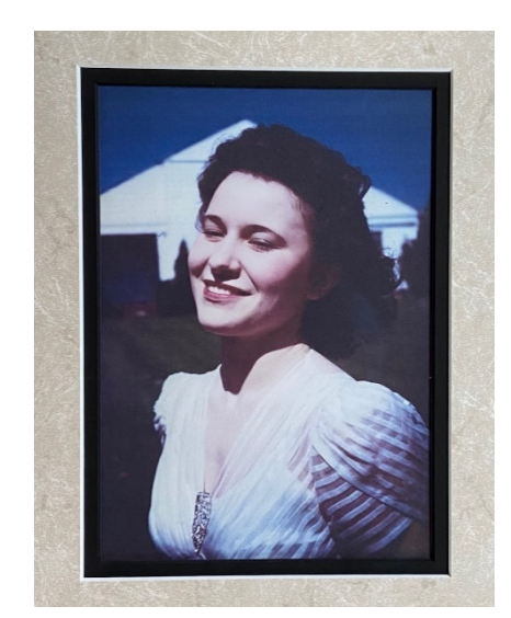
While this is not the mother I remember growing up, this picture embodies every bit of her spirit and beauty. What words do you use to describe your mother?