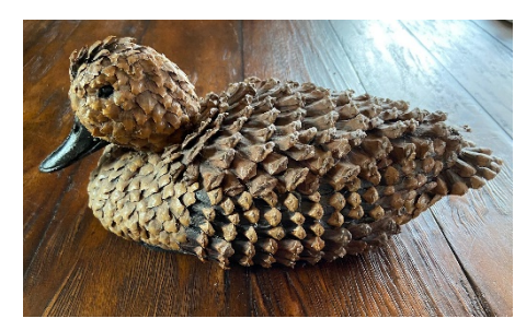
A plastic duck decoy is the starting point for this pine cone sculpture. Individual pine cone petals are attached with hot glue. Both patience & safety were needed for this class!

Mom taught many classes at Raven Hill, including creating "petal people" notecards and pinecone ducks. If I needed a certain display, she would make it happen, while at the same time teaching me something new. Raven Hill's dreams and ideas became hers and her creations are still scattered throughout the Center and my house.