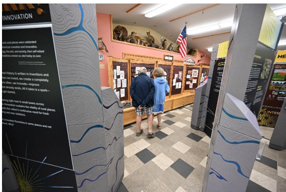
Raven Hill's companion exhibit features the inside of an old Patent Office, including several patent models. Between 1790 and 1880, models were required, when applying for a patent.