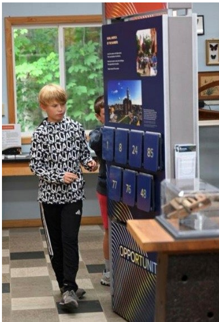
With its many interactive components, Spark! Places of Innovation appealed to everyone.