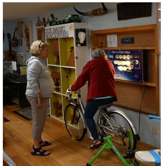
Even at an Open House, no one can resist spending time in the hands-on Discovery Room at Raven Hill, which sports its own innovative displays, such as the generator bike.