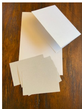
2 Cut cardstock & drawing paper