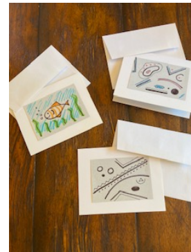
4 Sample cards