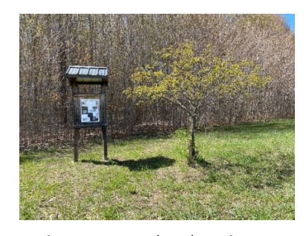
The Taxonomic (Taxi) Trail was established in 2006. Fifteen years later, new signs show how the different tree families can be used for food, medicine, shelter, etc. Get your exercise, while you read and learn!