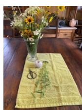
2 Start with 3