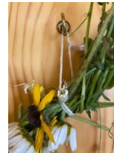
5 tie at end