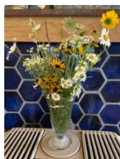
1 Pick flowers