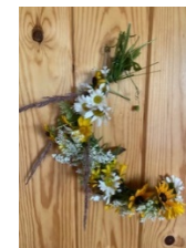
6 Hang or wear