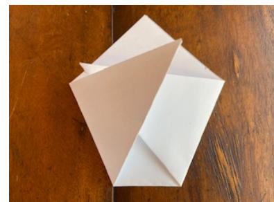
4 Fold other point across