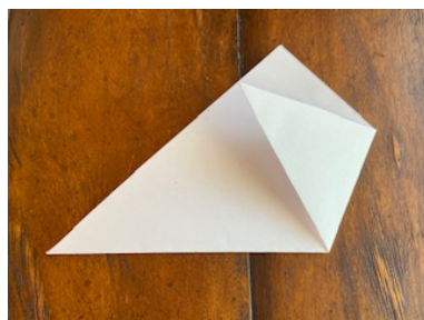
3 Fold bottom point across to side