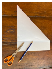
2 Fold corner to side and cut off extra