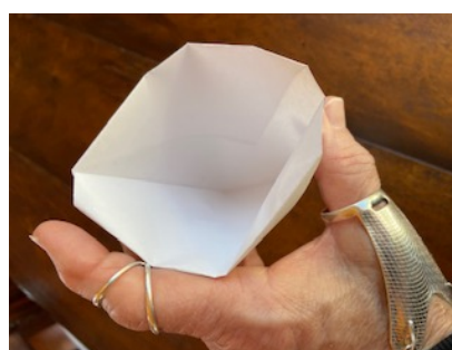
6 Open to make cup