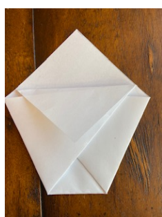
5 & 6. Fold top corner down, turn & fold other down