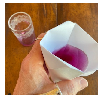
7 Get a drink in your cup