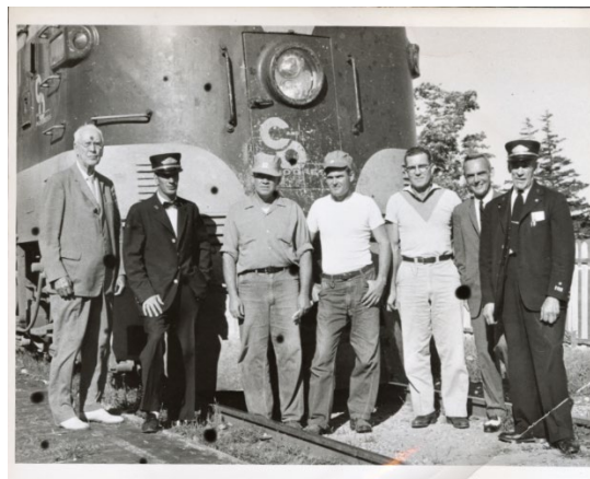
Different jobs | Different uniforms