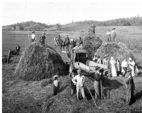
Families working together