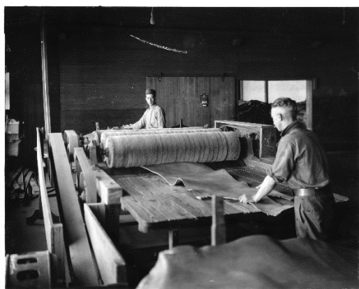
At work in the Tannery