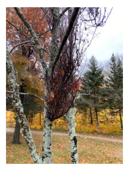
Who would have thought! Today, witch's brooms are grafted and grown as dwarf trees for rock gardens and miniature landscapes.

First, the serviceberry or juneberry in our yard sports several witch's brooms, which provide nesting places for birds and mammals. Witch's brooms grow over years on a tree or bush at a point damaged by fungi, insects, nematodes, viruses or other outside forces, causing a mutation, and creating the witch's broom. If you are riding around this fall and winter, keep your eyes open for witch's brooms!