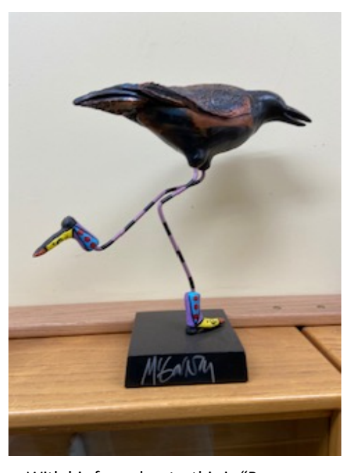
With his fancy boots, this is "Raven on the Run" –mascot for Raven Hill's 5k Family Run, normally held in August.

Finally, I can't resist including some art from the Center's Raven Collection! The Art Corridor is filled with all manner of ravens and crows from the corvidae family. Ravens and their cousins are clever and mystical birds, hence their association with Halloween. These are a few of my favorites.