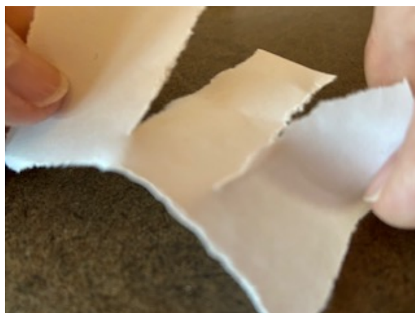
3 Hold outside corners & pull, not touching middle