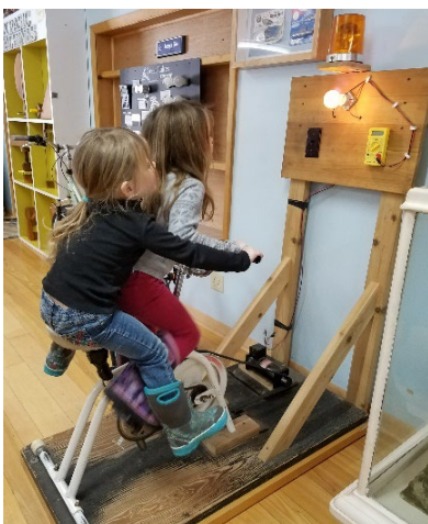
This is not really a bicycle built for two, but these sisters made it work! Sisterly love personified!