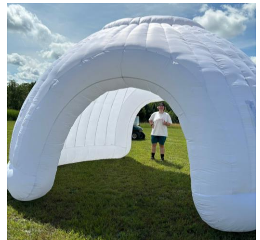
Two inflatables will become the temporary home for Raven Hill's Main Museum! Come check us out and be a part of the adventure!