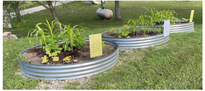
Thousands of years ago, Indigenous American cultures domesticated the Three Sisters—corn, beans and squash—and took advantage of their symbiotic relationship.