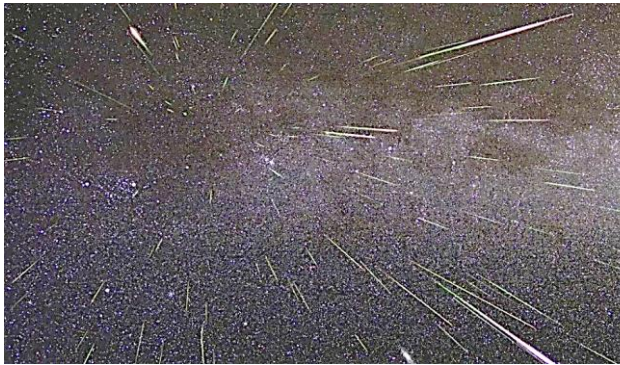
The Perseid Meteor Showers typically give us some of the most spectacular and reliable meteor shows with a high rate of meteors to see. We are looking forward to this annual night sky show. Join us at Raven Hill on August 11—8:30pm inside for a short program and then at 9:00pm outside under the stars!