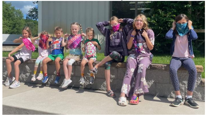
Shibori, always a class favorite, is a traditional Japanese technique that involves folding, twisting, or bunching fabric and binding it before dyeing to create unique patterns, each one equally as unique as the kids who created them!