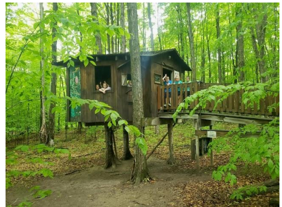
The Treehouse is always a favorite and Kingsley students were no exception!

What an exhilarating and action-packed week it was! On Tuesday, we hosted our final spring field trip with 115 energetic first graders and a multitude of enthusiastic parent chaperones, all exploring the wonders of Raven Hill both indoors and outside. Our new Under Michigan & Beyond exhibition is growing even more spectacular with the addition of a mesmerizing Fluorescent Rock and Mineral display, now ready to dazzle your senses. Meanwhile, exciting upgrades are happening on the Jurassic Park pathway—brick borders are being added to both sides of the existing walk to widen it, enhancing the experience and making it easier for visitors to journey through geologic time.