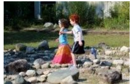
Raven Hill already has a small labyrinth in front of the Main Museum building. It is a favorite of the five-year-old crowd, who often insist on walking all their "big people" through the winding pathways of the labyrinth and doing it one person at a time!