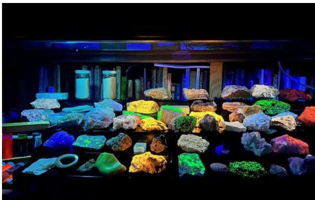
The Bookroom has been transformed into the Darkroom, allowing small groups to delight in the display of fluorescent rocks & minerals.