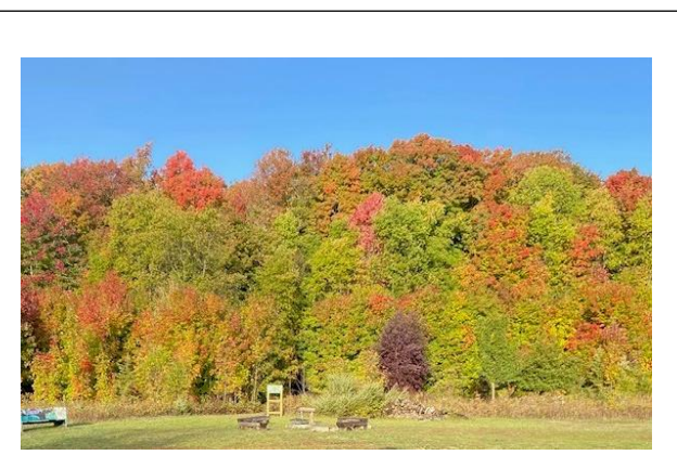
The fall colors are just starting to show, making the Center's campsite look even more inviting and encouraging thoughts of an old-fashioned bonfire!

The temperature and colors indicate that fall is here. School has been in session for more than a month. The Smithsonian exhibit has moved on. Raven Hill is now open weekends and other times by appointment. One might assume that things would be rather quiet here at Raven Hill Discovery Center, but the Center shows no sign of slowing down! Staff and volunteers continue to be busy. They are working on upgrading exhibits & facilities; hosting field trips and encouraging teachers in their endeavors.