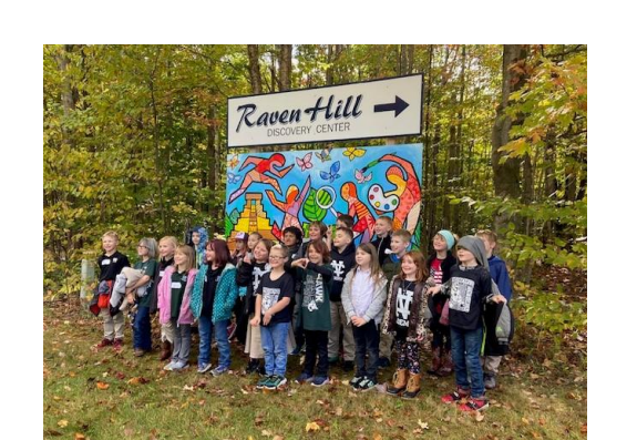
First and second graders from Mancelona's North Central Academy visited Raven Hill on Thursday and enjoyed exploring indoors and outside.

Two things always stand out this time of the year. First, looking <u>back</u>, it is amazing to think of all the teamwork that goes into making Raven Hill what it is. There is an unseen collaboration that goes on between volunteers who may or may not even know of each other's existence. But they all work toward a common goal of making sure that Raven Hill Discovery Center continues to function to the delight of the families, teachers and students who come here to explore and learn.