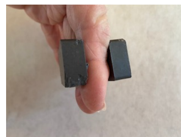
3. What does force goes thru?

ENJOY AND, REMEMBER, PUT EVERYTHING AWAY, WHEN YOU ARE DONE BEING A SCIENTIST!