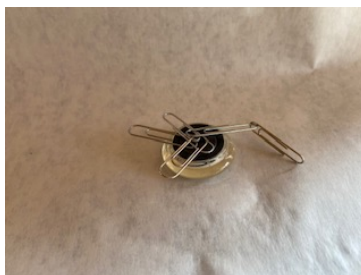
2. What attracts or sticks?