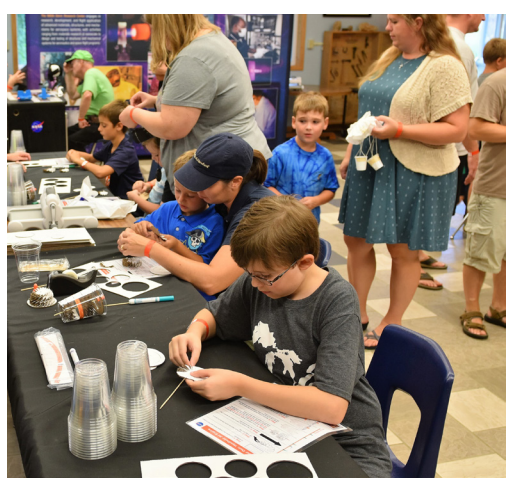
Visitors learned about NASA's Orion Missions which will take us to Mars in the 2030s. Guests were even able to build models of the Orion space craft.