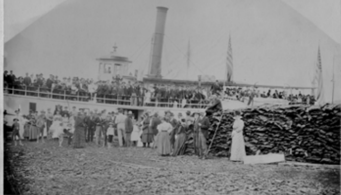
LEBOR DRY EXCURSION. BOYNE CITY TO EAST JORDAN, SEPTEMBER 9TH, 1898.